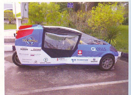
The solar taxi