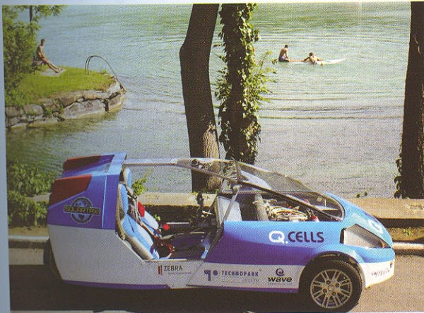
... in Austria