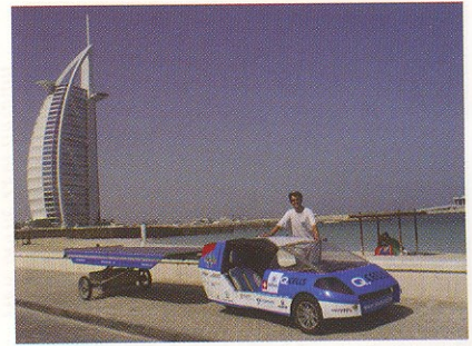
... in front of Bur Al Arab in Dubai