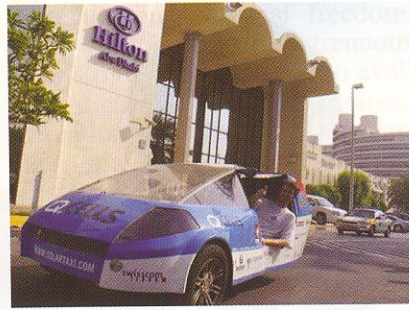
... in front of Hilton Abu Dhabi