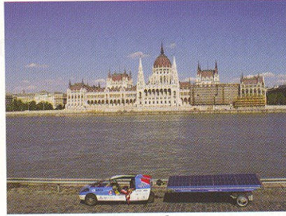
... in Budapest