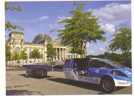
... in Berlin - Germany